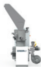
INTAREMA® 504 K ZeroWastePro