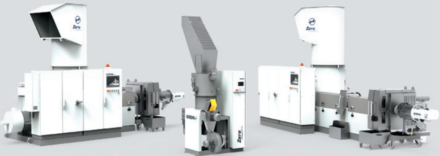
INTAREMA® T ZeroWastePro

Average output rates in kg/h, depending on material properties such as residual moisture, print, degree of contamination, etc.