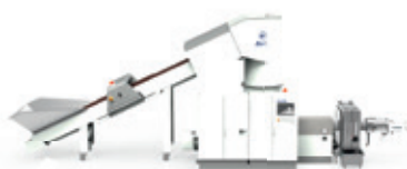
INTAREMA® 605 T ZeroWastePro