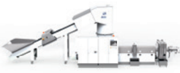
INTAREMA® 605 TE ZeroWastePro